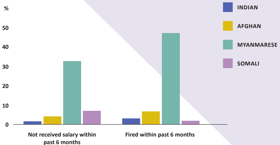
Figure 1: Proportion of employed income earners with negative experiences

The profiling exercise showed that each refugee community faced different challenges in terms of access to employment, housing and finances as well as in relation to physical safety. Refugees from Myanmar and Somalia faced the most discrimination and harassment, affecting their access to the job market and their housing security and education situation. Afghans experienced less discrimination from the local community, however they lacked the intra-community support enjoyed by the other two groups.