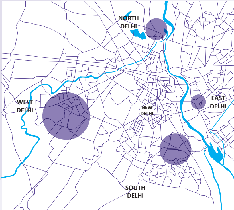
Map: Distribution of interviewed households in Delhi districts

High concentration areas were selected for data collection